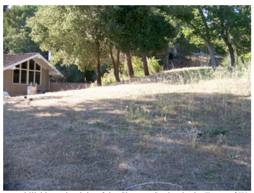
Native grass hillside to the right of the Chevron Station in the Town of Woodside. Stipa grass covers the slope about 50%, and in the shade of oaks have close to 100% cover of the native, shade-loving native Short Brome grass.