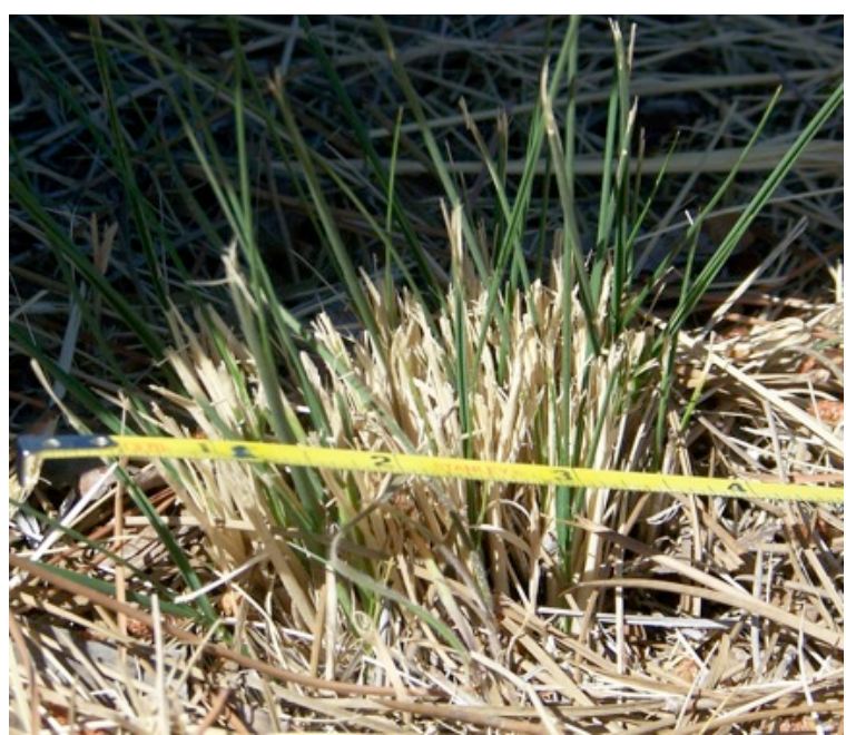
Stipa grass mowed, regrowing and staying green in June without rain or watering, after four years of severe drought.