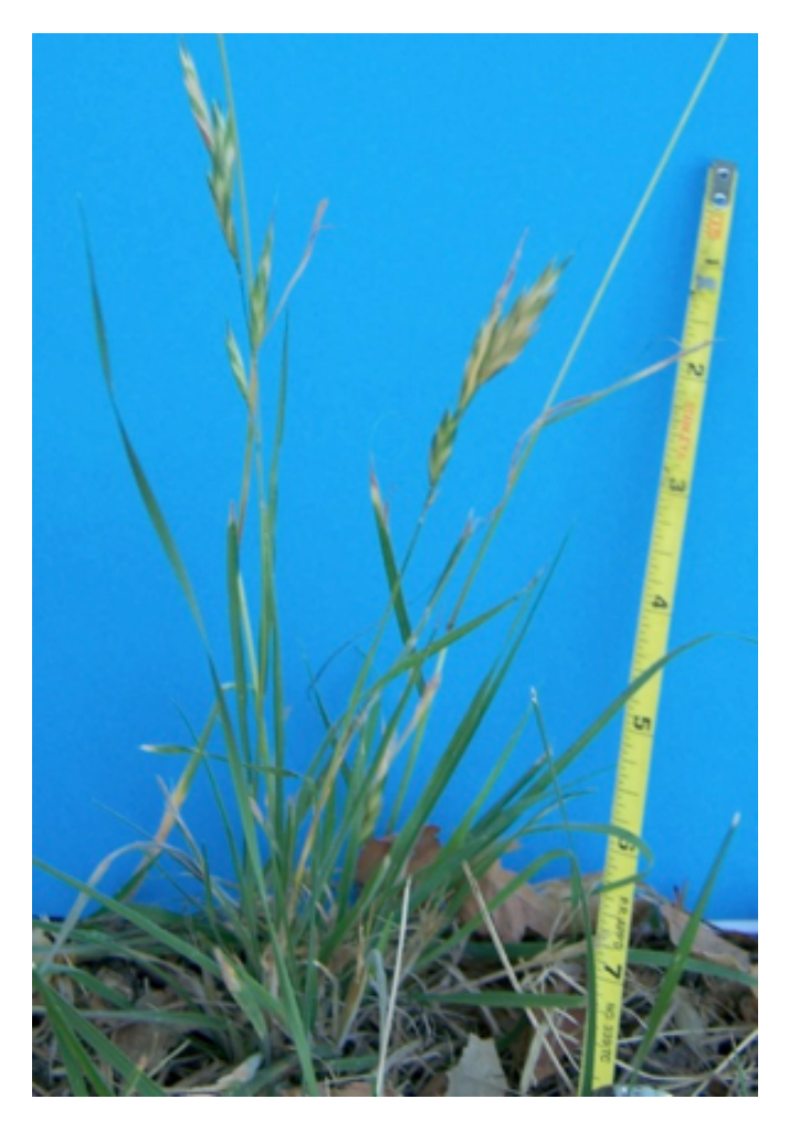
Short Brome grass, only growing in the shade of oaks on the hill to the right of Chevron Station, and in the gully below the Town Hall parking lot. These are the last stand for 10 miles.