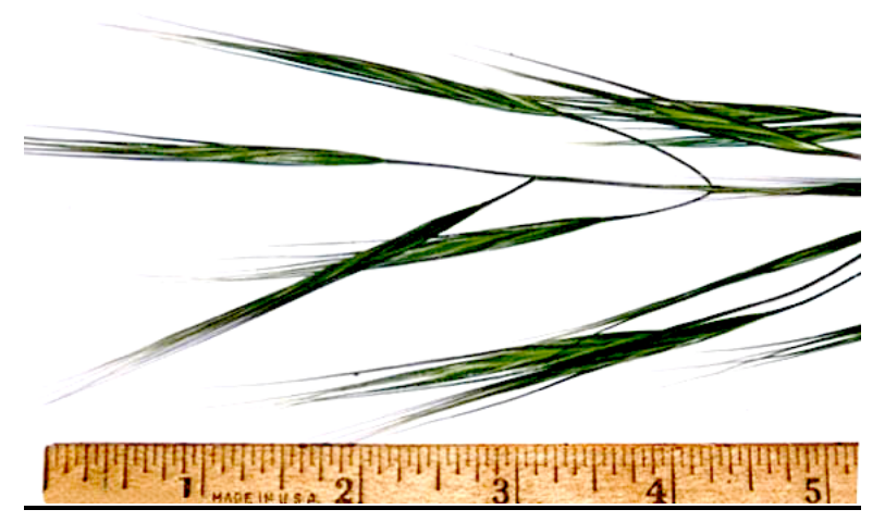
<u> RIPGUT BROME</u> -- <u>Common in poor soils, grows in both sun and shade – WEED.</u></u>