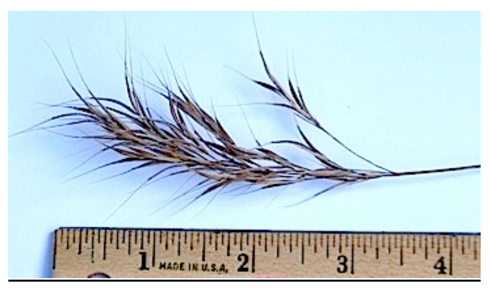
<u>RED BROME</u> – Fortunately, not common on the SF Peninsula yet, full sun, poor soil – WEED.

<u>RATTLESNAKE GRASS</u> – Moving into the Peninsula from Monterey, in shade under oaks in dry soil – WEED.