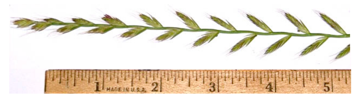
<u>ITALIAN RYEGRASS</u> -- Commonly planted in pastures or in lawns – WEED.