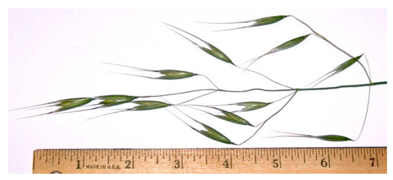
WILD OATS -- Probably California's most common European grass, likes rich soil—WEED.