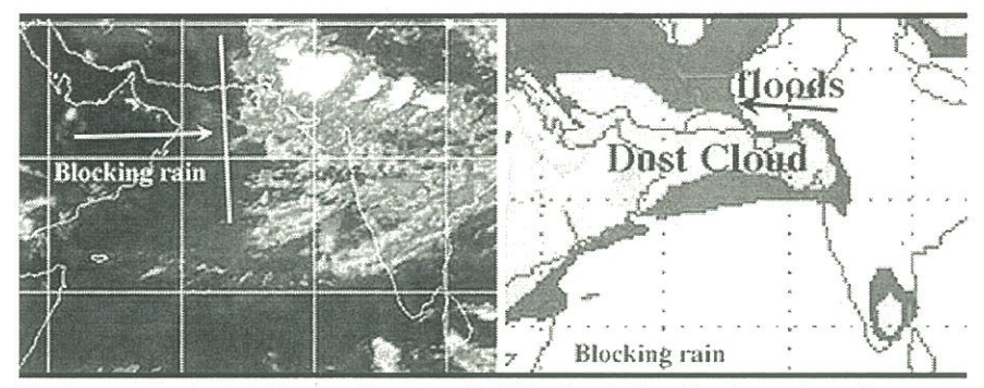
Floods were occurring in Pakistan on September 11, 2012, after the Dust Cloud moved away from Pakistan and retreated to Arabia.

tion to worldwide weather. And there has been little understanding of the power of this phenomenon's impact on global weather patterns.