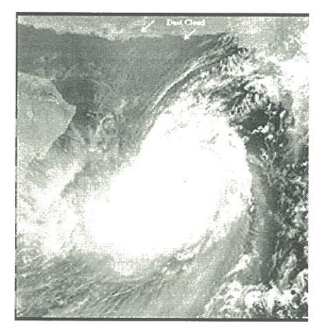
Super tropical Category-5 cyclone Gonu in June 2007, being trapped, engulfed and dissipated by the Arabian portion of the Pakistan-Arabia Dust Cloud. The atmospheric dust cloud that is hovering over Pakistan and Arabia each summer is the most powerful of all of dust clouds so far.

Throughout human history, people have largely believed that we were at the mercy of whatever weather occurred—