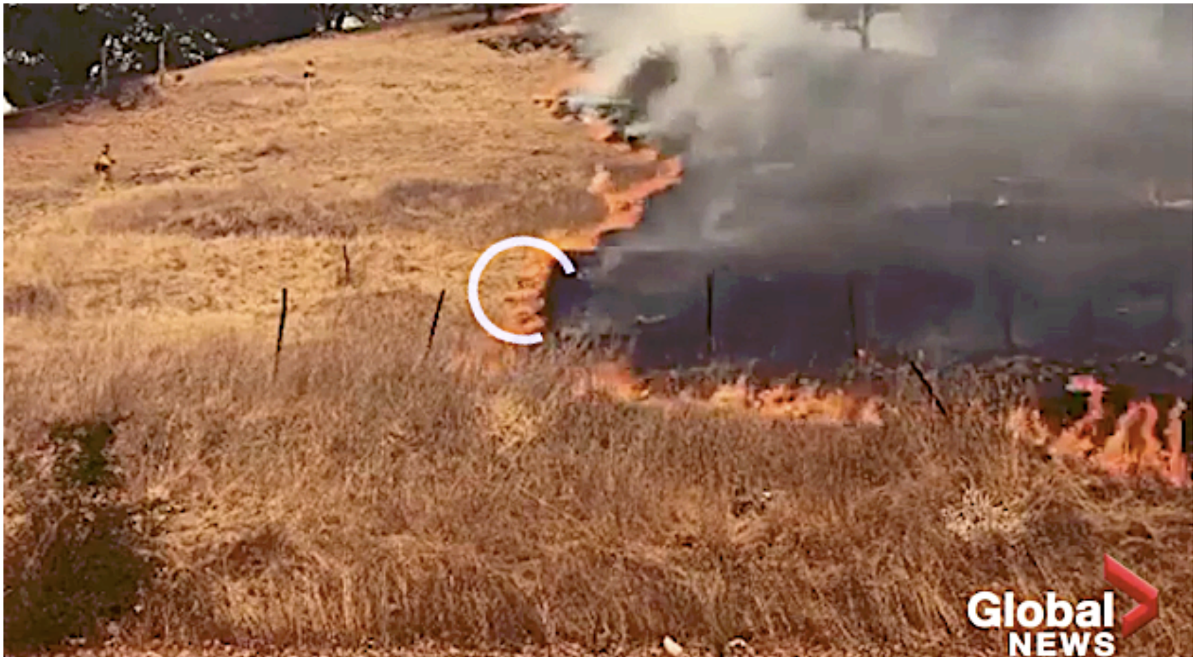
Screen-shot of a video of a Healdsburg weed-grass fire.

The weed grasses that now cover California 99%, provide the kindling that catch the trees and shrubs on fire.