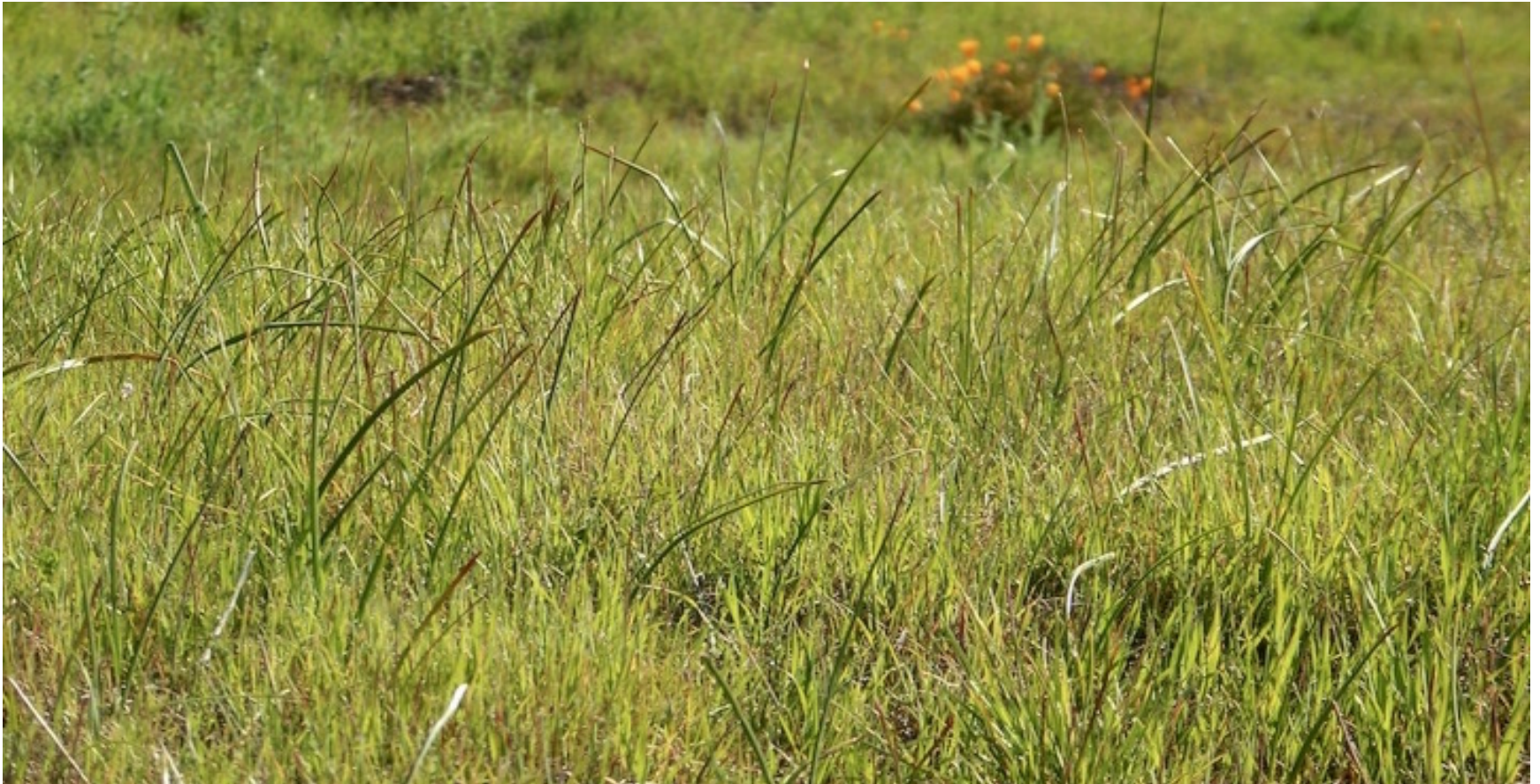
Calochortus, Mariposa or butterfly lily leaves sprouting in early spring.

Some of the rare wildflowers, you must be very careful when mowing, because their leaves look similar to the weed grasses.