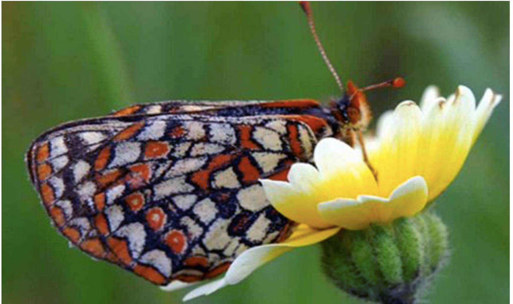
Bay Checkerspot on tidy tips

And you could also be providing new habitat for the native pollinators, like the rare Western bumblebee and butterflies.