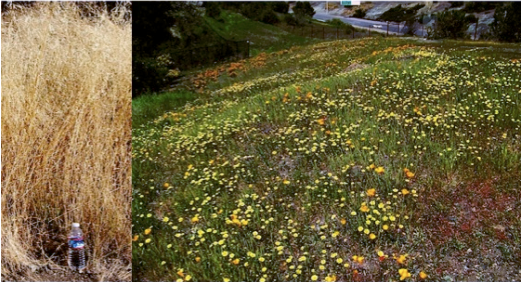
Before-and after photos at Kite Hill, from the northeast corner.

Instead, you want to mow earlier in spring, and mow one foot high, and mow monthly -- to eliminate the flammable weeds and unearth the dormant wildflower and native grass seeds.